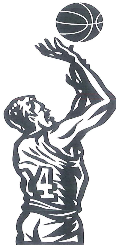
Skill Builders Basketball Camp

Athletes will be challenged to take their basketball game to the next level through drills, contests, and fitness workouts. This camp is suitable for all skill levels. All campers will receive a free camp shirt. Awards will be handed out for 3 point shootout, free throws, speed dribbling, and spot shooting. Camp hours are from 9:00 a.m. to 3:30 p.m. Extended daycare from 6:30 a.m. to 6:30 p.m. is included.